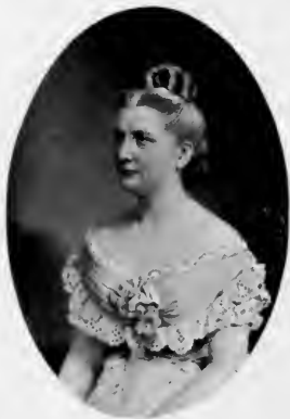
Mrs. Henry E. Johnston (Harriet Lane) Page 219